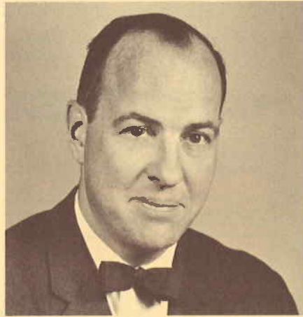
VINCENT DOLE, M.D.